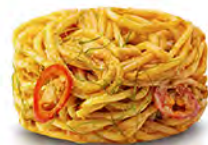
Panang Curry 9.95