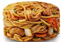
Cashew Nut 9.95