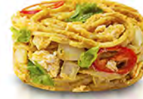
Stir Fried Curry 9.95