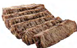
Grilled Beef + 4.5