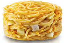
Garlic Cream 9.95