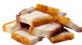
Crispy Pork Belly + 5.0