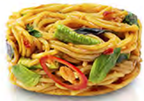
Chilli Basil 9.95