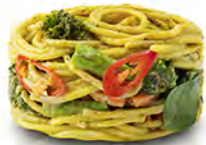
Green Curry 9.95