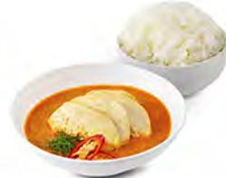
Panang Curry 9.95