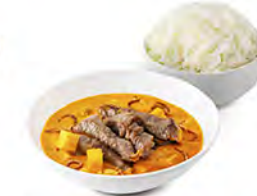
Massaman Curry 9.95