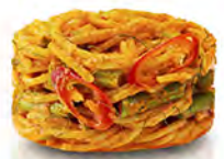
Pad Prik Khing 9.95