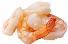
Prawn + 4.5