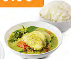
Green Curry 9.95