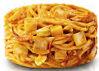
Massaman Curry 9.95