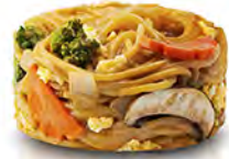
Oyster Sauce 9.95